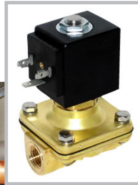
Auto Fluid Makeup Solenoid Valve