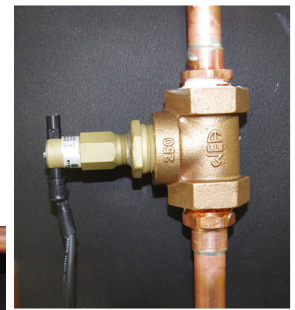
Auto Level Switch (this model shown is for Stainless Steel Tanks)