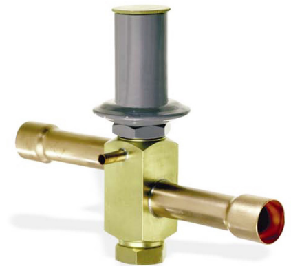
Hot Gas By-Pass Valve