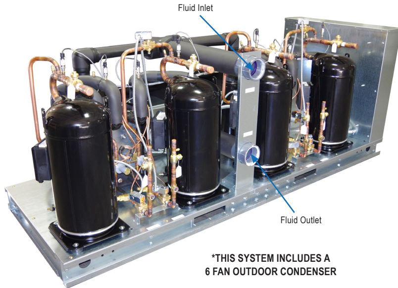
*THIS SYSTEM INCLUDES A 6 FAN OUTDOOR CONDENSER

STANDARD ON ALL J&M MODELS: Idec Microprocessor Controller with Touch Screen Display.