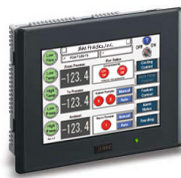
Easy to Use Touch Screen Display on ALL J&M Chiller Models