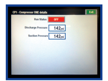
Compressor Operation Status and Pressures