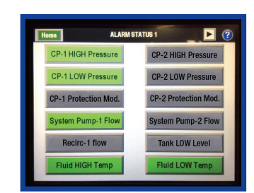
Alarm Status Screen 1