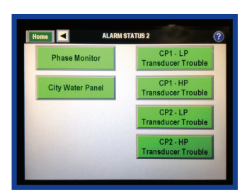
Alarm Status Screen 2