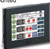
Easy to Use Touch Screen Display on ALL J&M Chiller Models