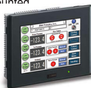
Easy to Use Touch Screen Display on ALL J&M Chiller Models