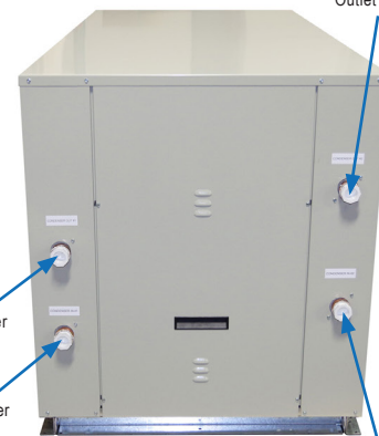
Condenser Outlet #2