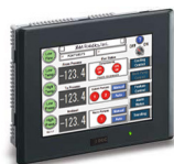
Easy to Use Touch Screen Display on ALL J&M Chiller Models