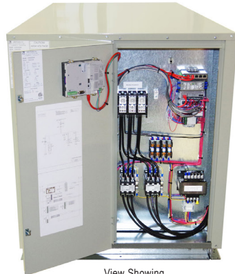
View Showing Electrical Panel Open

STANDARD ON ALL J&M MODELS: Pentra Microsmart, Programmable Logic Controller (PLC) with HMI Touch Screen Display.