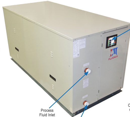
Process Fluid Inlet