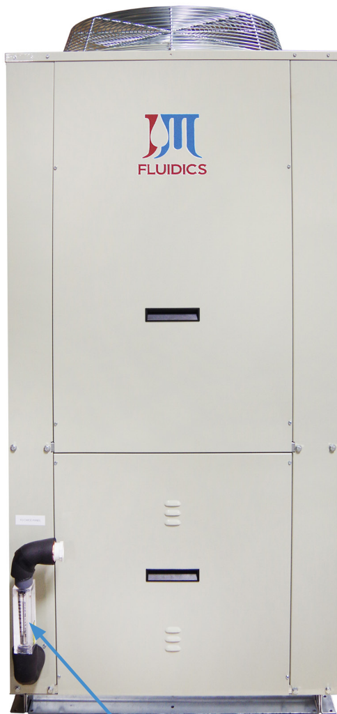
Installed Water/Liquid Flow Meter

A water/liquid flow meter is a device used to measure the flow rate or quantity of liquid moving through a pipe. Flow measurement applications are very diverse and each situation has its own constraints and engineering requirements. Flow meters are referred to by many names, such as flow gauge, flow indicator, liquid meter, etc. depending on the particular industry; however the function, to measure flow, remains the same.